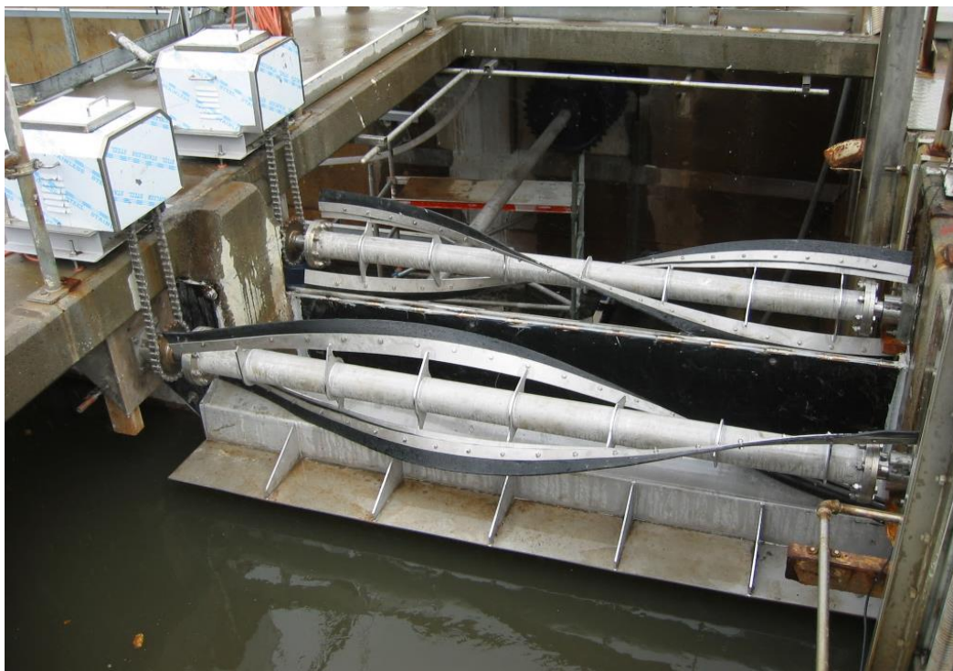
Helical Scum Skimmer 1 Drive per 1 Skimmer