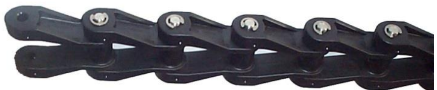
Non-Metallic Drive Chain

VoR Environmental Australia Pty Ltd 13-15 Aylesbury Street Botany, 2019, Australia