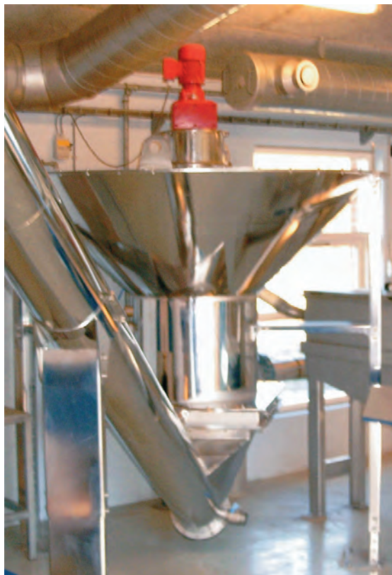
The high finish guarantees a long life time