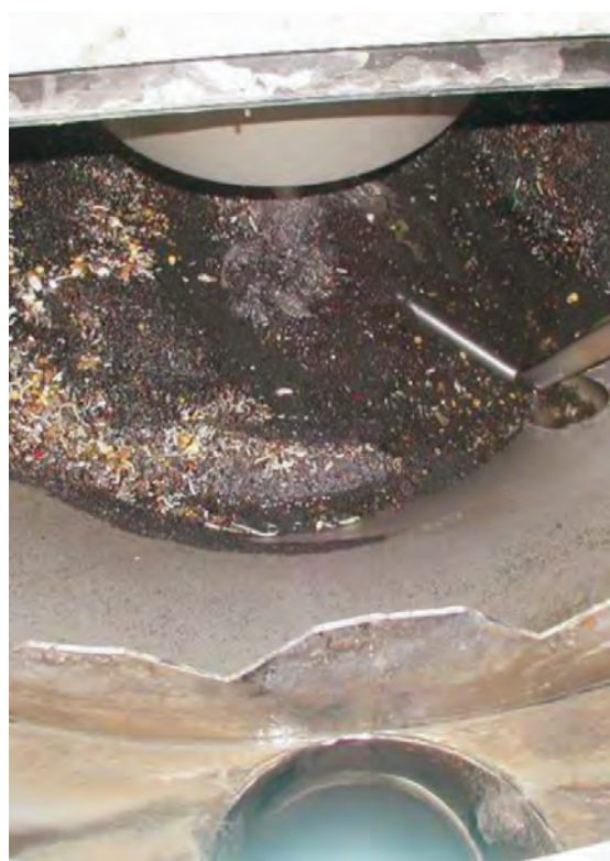
Inside the Sand Washer