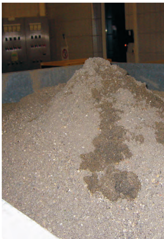
End product - DS content > 90% - Ignition loss < 5%