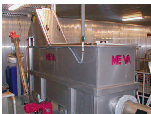
Meva Monoscreen in combination with a Screw Wash Press