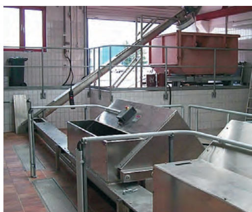
High accessibility guarantees easy maintenance and visual control of the screen