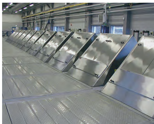
Meva Monoscreen in a WWTP

Meva Monoscreen operates intermittently. Thus the operation can be adjusted to the incoming flow. A level sensor is installed in the channel in front of the screen. The screen starts when a pre-set water level is reached and operates until the water level is below the pre-set value. The cycle is repeated when the level is reached again.