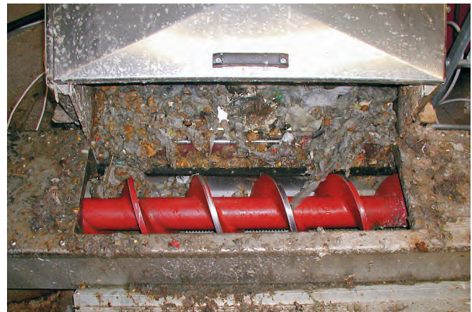
Feeding the Screw Wash Press