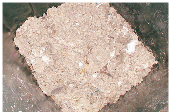
End product: washed, pressed and shredded screenings