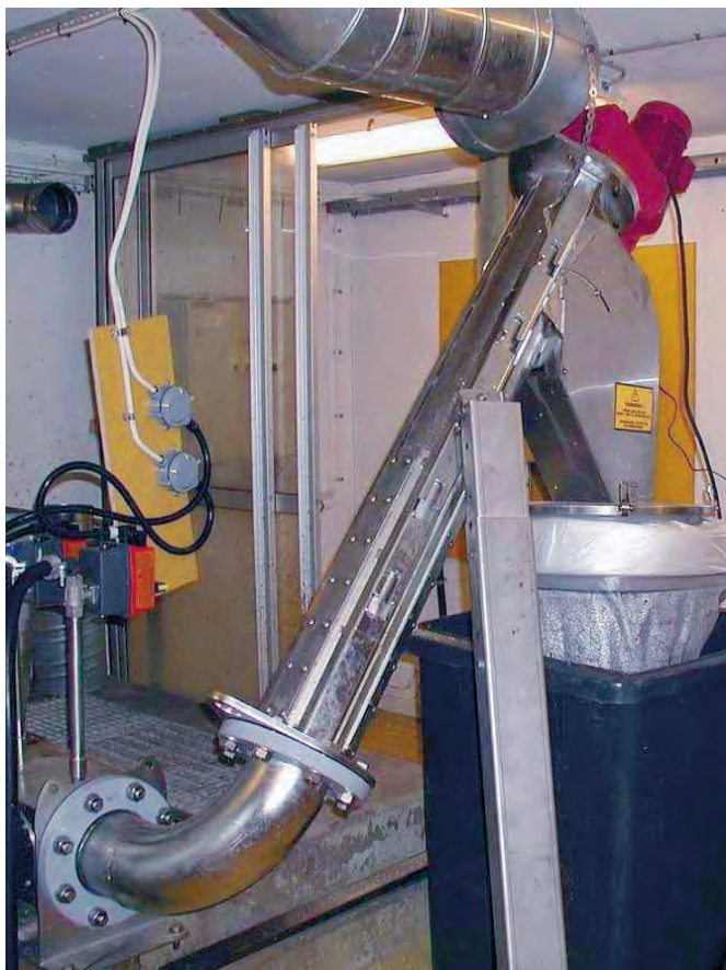
Meva Counter Pressure Screw CPS