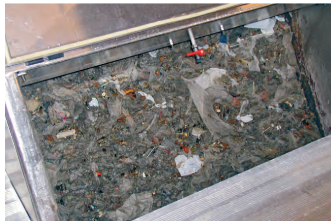
Screenings before washing